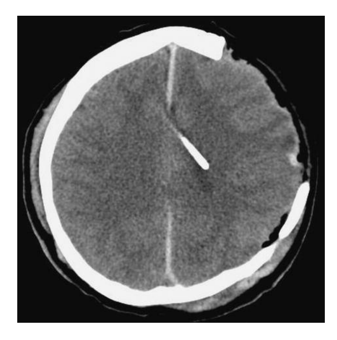
FIG. 2. — The head computed tomographic scan revealed the catheter was located in the contralateral cerebrum.

The EVD placement is one of the most effective and most frequently used therapeutic procedures in neurosurgery. EVD allows not only continuous